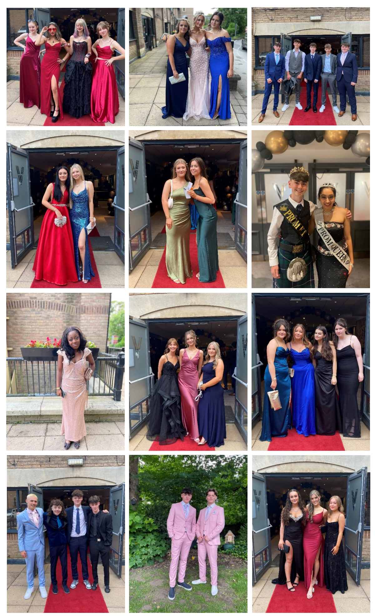
'Opportunity and achievement for all'