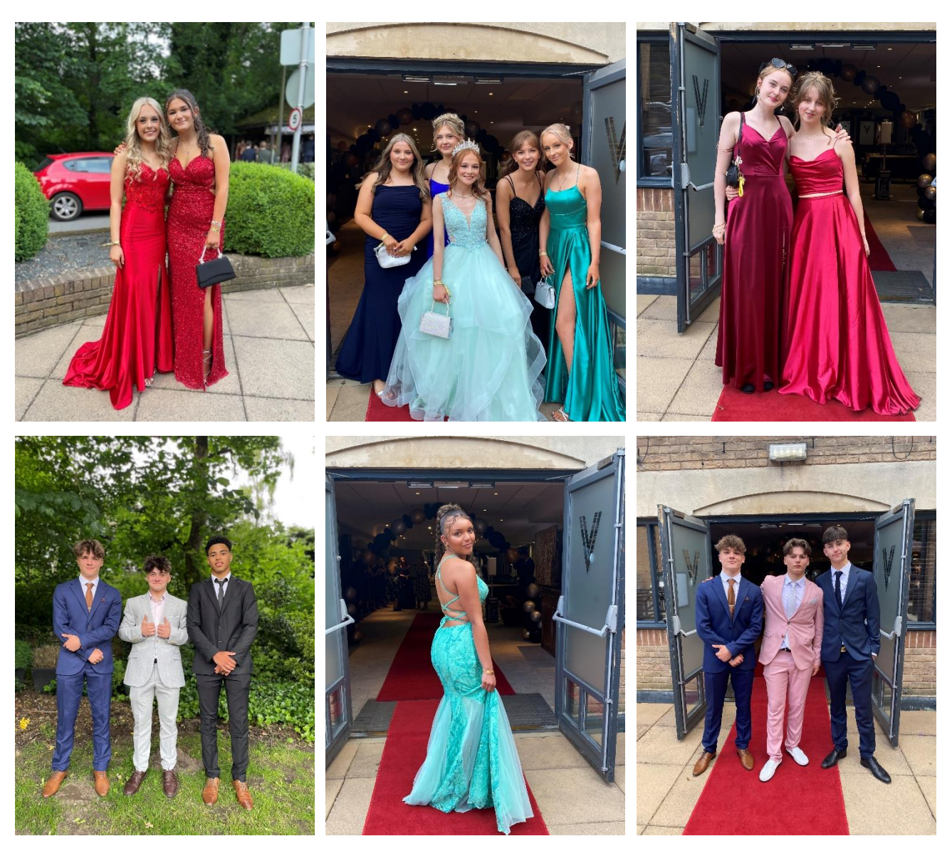
'Opportunity and achievement for all'

Our Year 11 students had a fantastic evening last Friday at their prom. They all looked amazing and we can't wait to see many of you joining the Sixth Form at Horsforth in September.